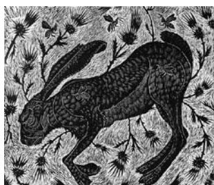
Sleeping Ophelia , 2018, Wood block print