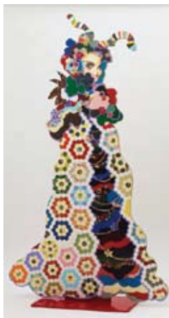
Alicia Paz Boxer, 2013 Mixed media on wood with metal base 180 x 110 x 40 cm

An international group exhibition that explores a variety of experiences of the contemporary female flâneur, if indeed there is such a thing. In 19 th century France, where the term originated, the flâneur was a man and usually understood to be a wealthy, urban explorer with time on his hands. Perceived as an aesthete and a literary figure, the flâneur was a significant observer of contemporary life. A flâneuse is thought to be a woman that behaves like a flâneur, but is that really the case? Contemporary artists respond to this question.