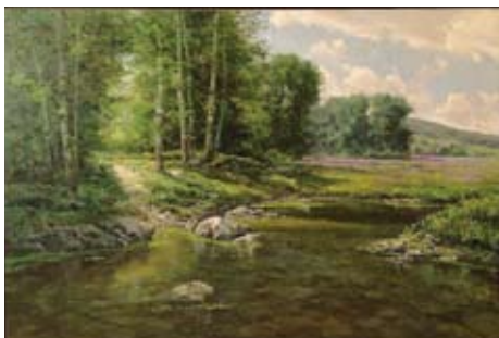
Path to the River